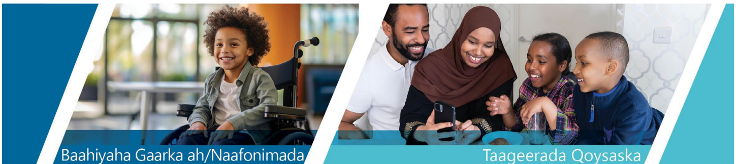
Baahiyaha Gaarka ah/Naafonimada